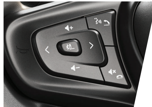
STEERING MOUNTED CONTROLS