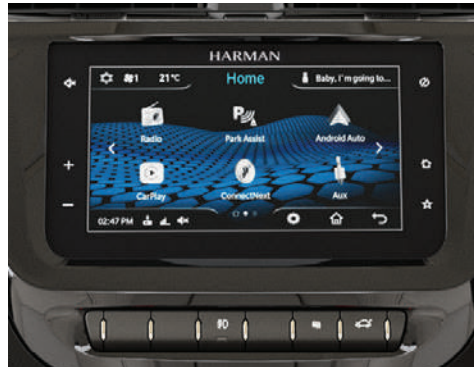
17.78 cm TOUCHSCREEN HARMAN™ INFOTAINMENT SYSTEM