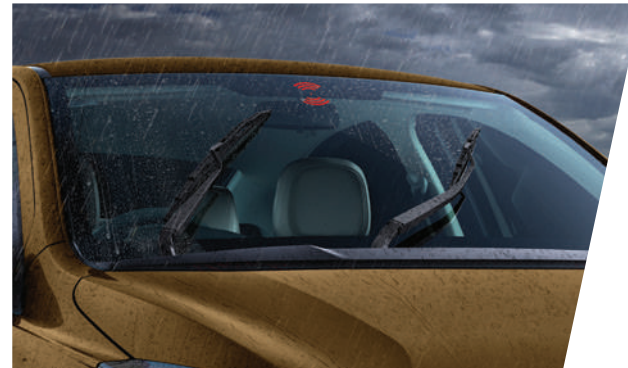
RAIN SENSING WIPERS