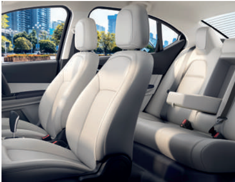
PREMIUM BENECKE KALIKO™ LEATHERETTE SEATS