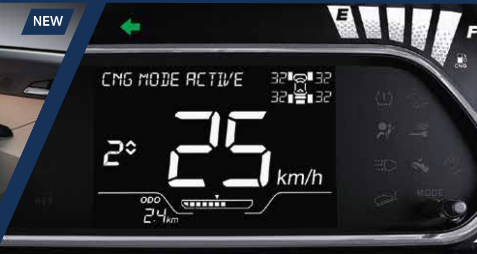
Tyre Pressure Monitoring System (TPMS)