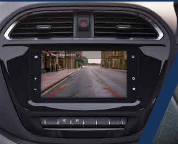
Reverse Parking Camera