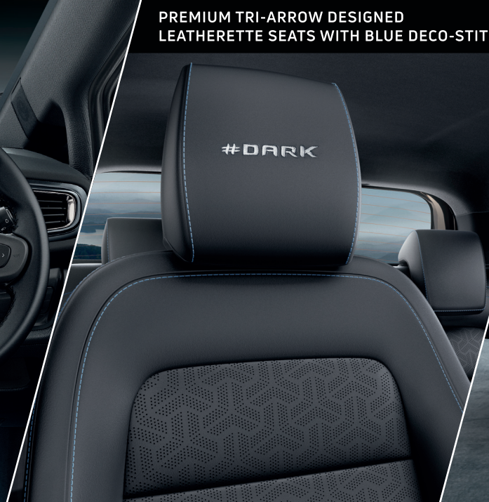
PREMIUM TRI-ARROW DESIGNED LEATHERETTE SEATS WITH BLUE DECO-STITCH