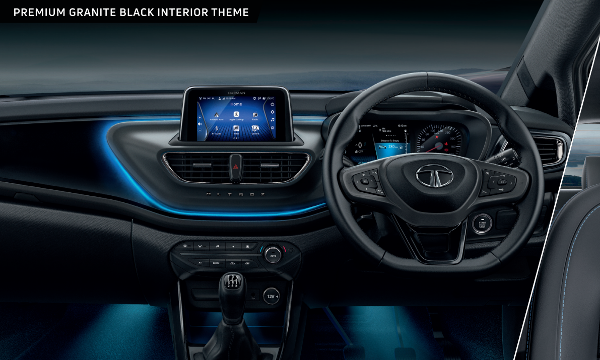
PREMIUM GRANITE BLACK INTERIOR THEME