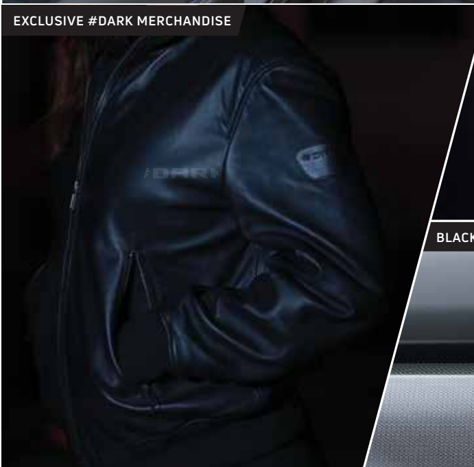
EXCLUSIVE #DARK MERCHANDISE