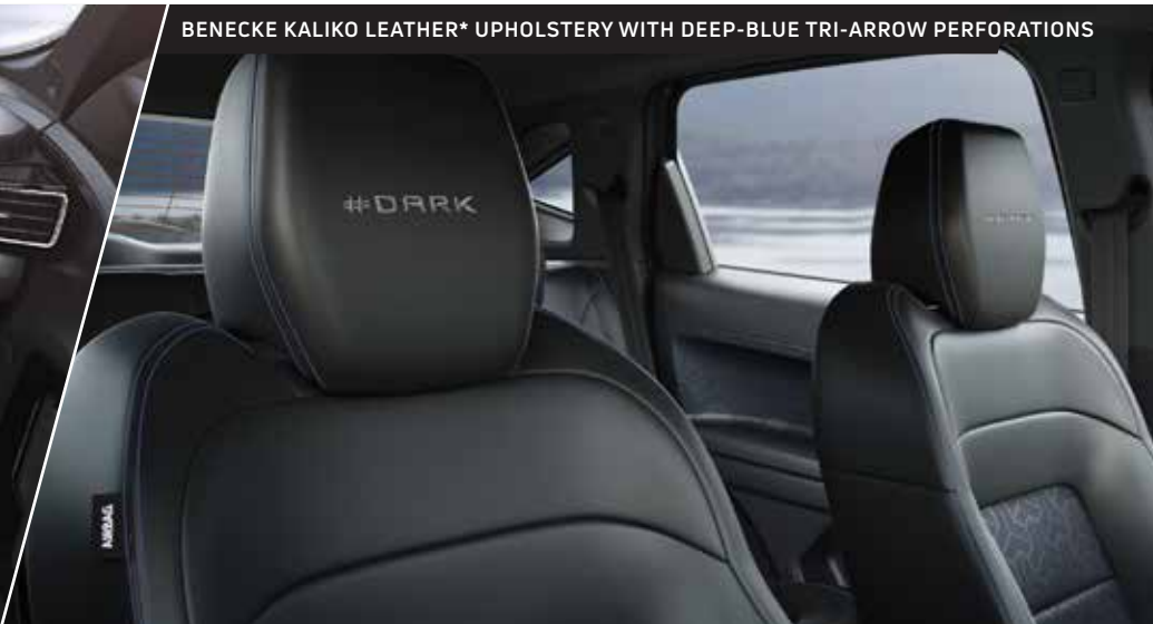
BENECKE KALIKO LEATHER* UPHOLSTERY WITH DEEP-BLUE TRI-ARROW PERFORATIONS