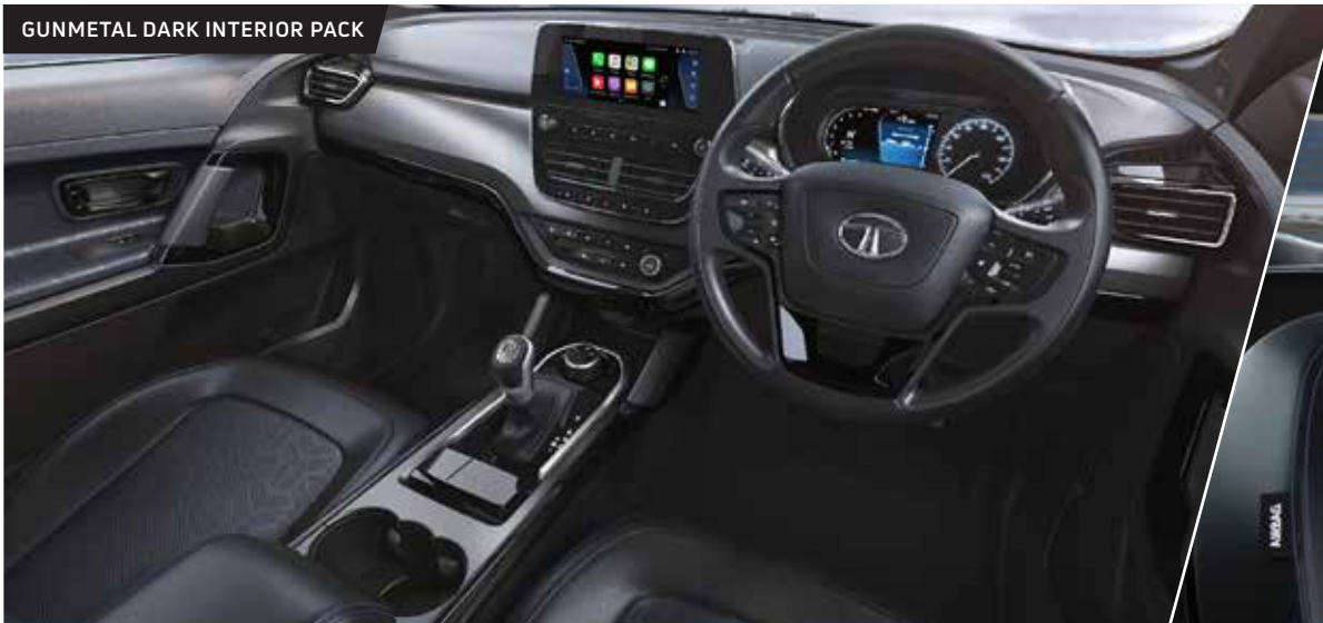
GUNMETAL DARK INTERIOR PACK