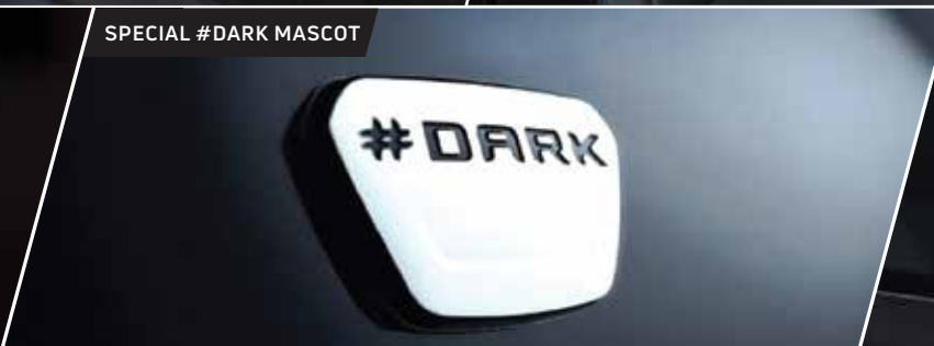
SPECIAL #DARK MASCOT