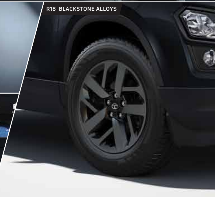
R18 BLACKSTONE ALLOYS